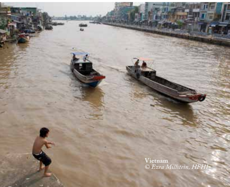
Vietnam