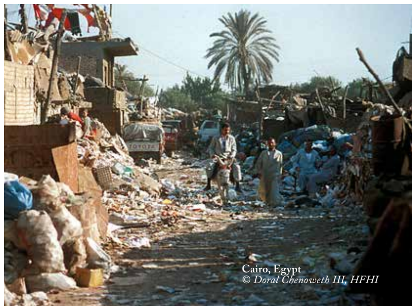
Cairo, Egypt